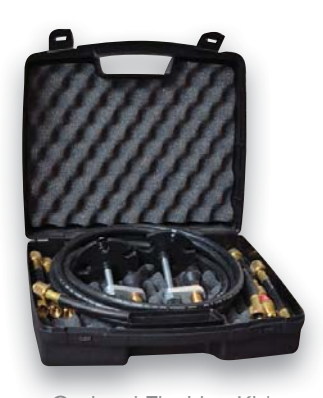
Optional Flushing Kit*