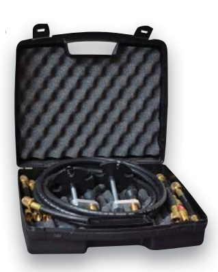
Optional Flushing Kit*