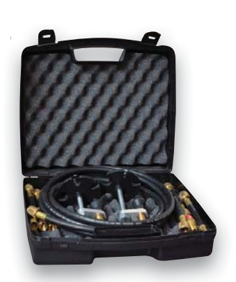
Optional Flushing Kit*