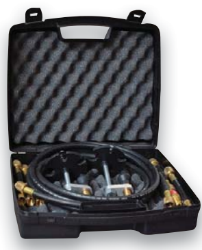
Optional Flushing Kit*