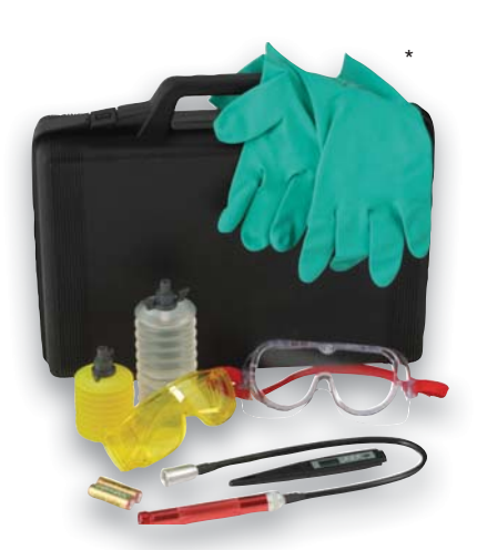
Optional Accessory Kit*