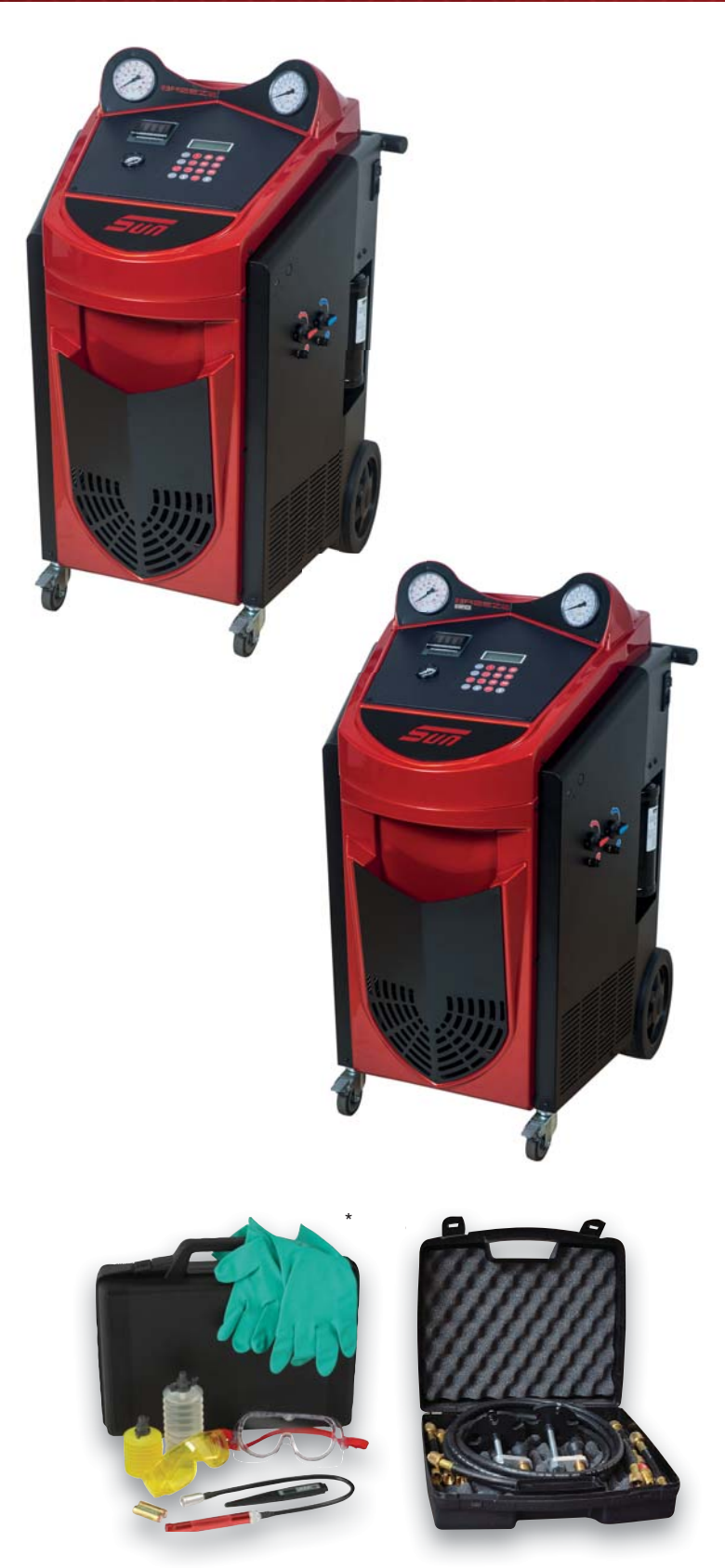
Optional Accessory Kit*